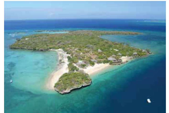
AZURA QUILALEA PRIVATE ISLAND Mozambique

reservations@azura-retreats.com +27 (0)11 467 0907 www.azura-retreats.com