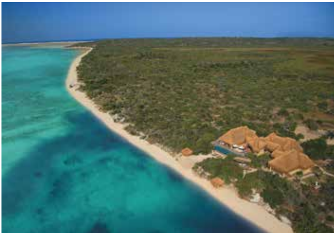
AZURA BENGUERRA ISLAND Mozambique