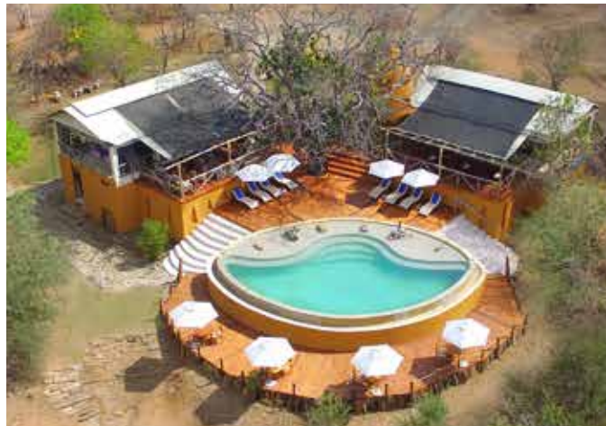
AZURA SELOUS GAME RESERVE Tanzania